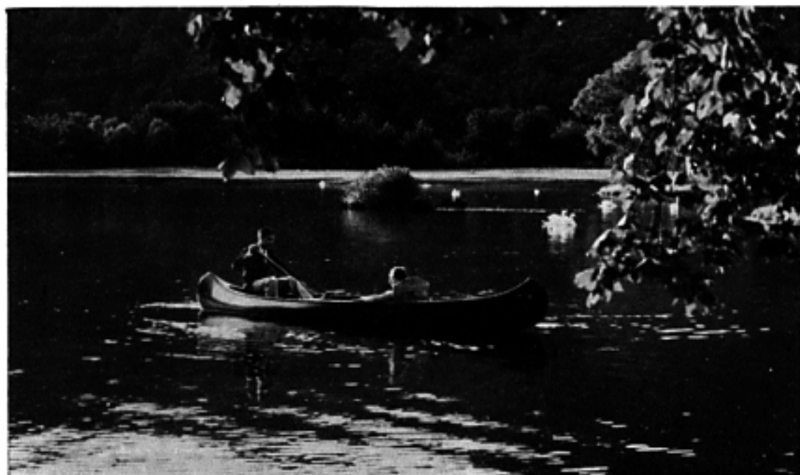
A beautiful water scene with an "Old Town" for the centerpiece

Steadiness comes nearly as much from length as from width. Consequently the regular seventeen and eighteen footers are steadier than the regular sixteen footers. To meet the