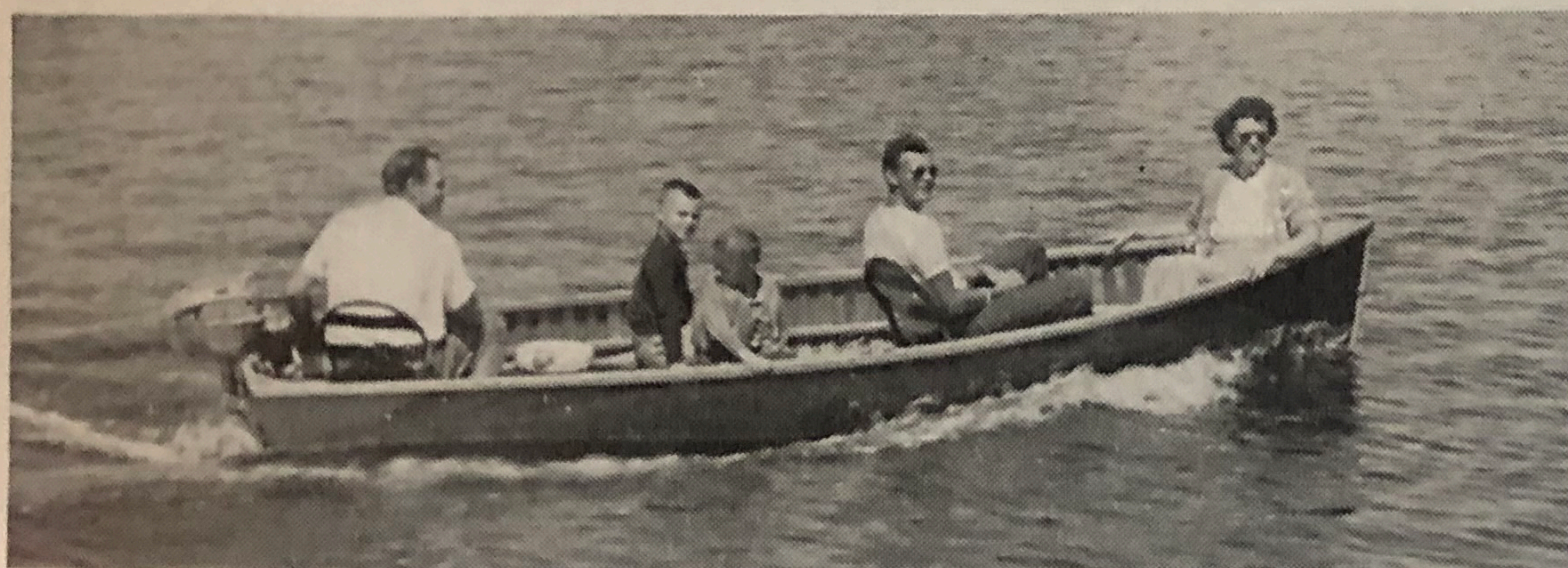
14 ft. with 5 H.P. Motor