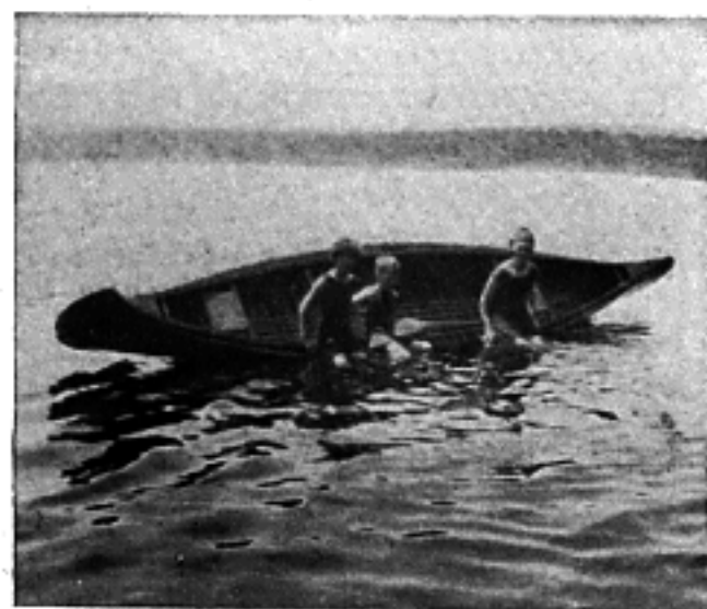
Shows difficulty of upsetting

If you keep away from the water because of distrust of the ordinary rowboat or canoe, try this canoe. Boys and men, because of its safety, use it even more readily than the